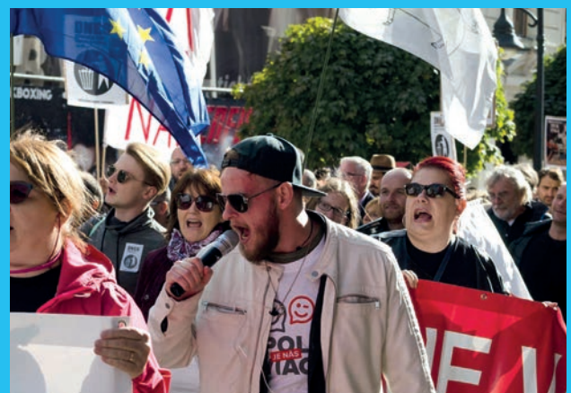
The “Together We Are More” campaign led by the Centre for Community Organising in Slovakia, successfully mobilized to defeat the rightwing populist party in regional elections.

The coalition increased turnout in the election by 60% above average, winning decisively. CKO has now scaled up its community organising work to include new projects in smaller rural communities in the region.