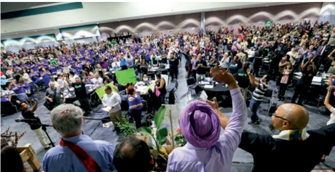
Faith in Action is the largest faith-based community organising network in the United States.