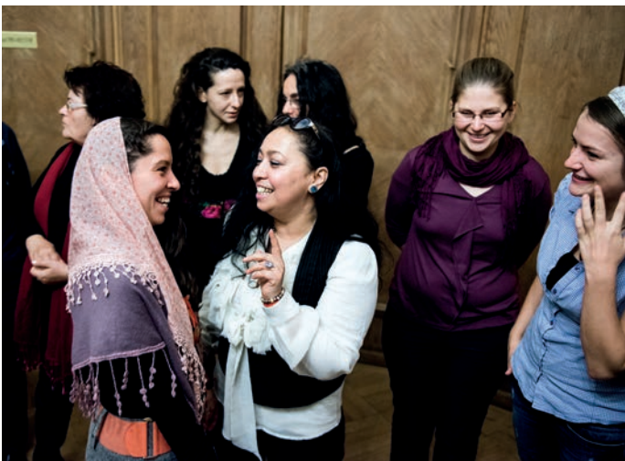
Participants share a laugh at a seminar on European Romani women’s activism at the Central European University in Budapest.